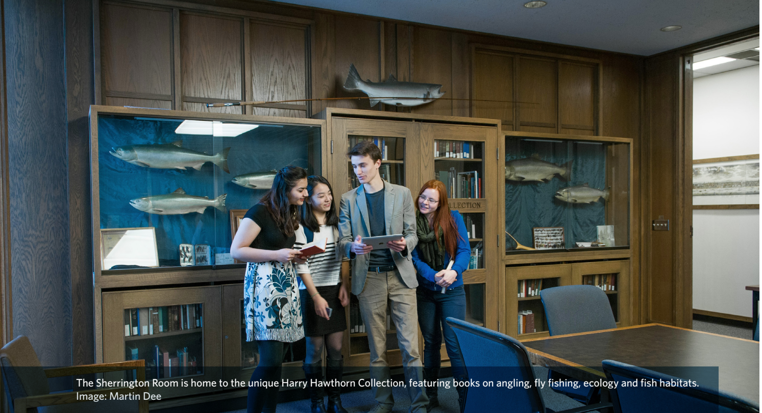
The Sherrington Room is home to the unique Harry Hawthorn Collection, featuring books on angling, fly fishing, ecology and fish habitats.