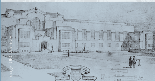
A plan of the proposed University Library, circa 1923

UBC Library will celebrate its 100th anniversary in 2015, the same year that the University celebrates its centennial.