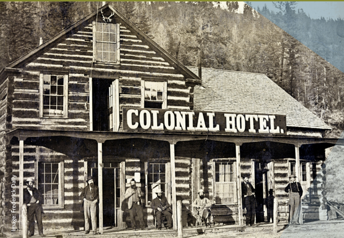
Photo donation offers captivating glimpse into B.C. history