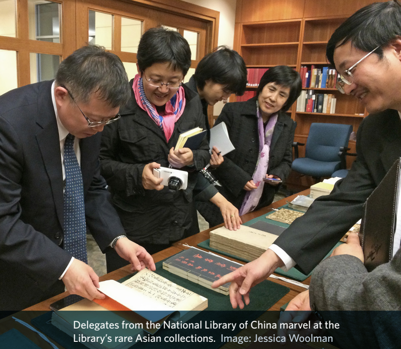
Delegates from the National Library of China marvel at the Library's rare Asian collections.